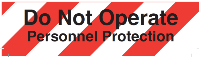
Rear of PC10C Tag