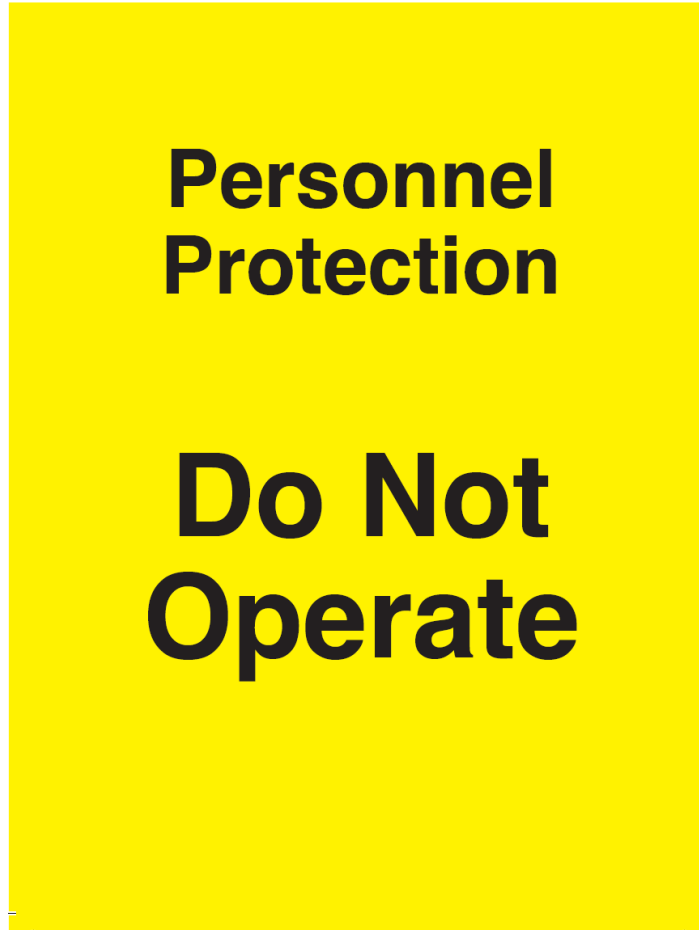
Front of PC3 Tag